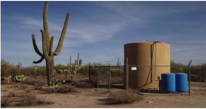
Figure 2. Typical Domestic Well System with Storage and Two Pressure Tanks, and Booster Pumps.

If the sustained yield of the well is insufficient for the landowner's immediate needs, water storage tanks and secondary booster systems are constructed to provide higher flow rates. If the sustained yield of the well and pumping equipment is sufficient for the homeowner's needs a smaller water system can provide the needed water.